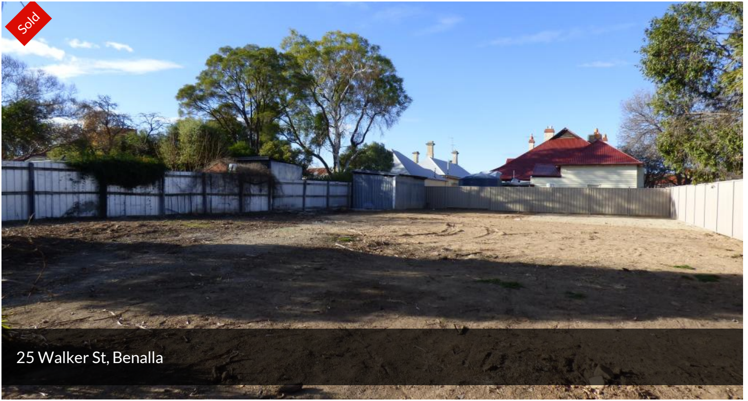
25 Walker St, Benalla