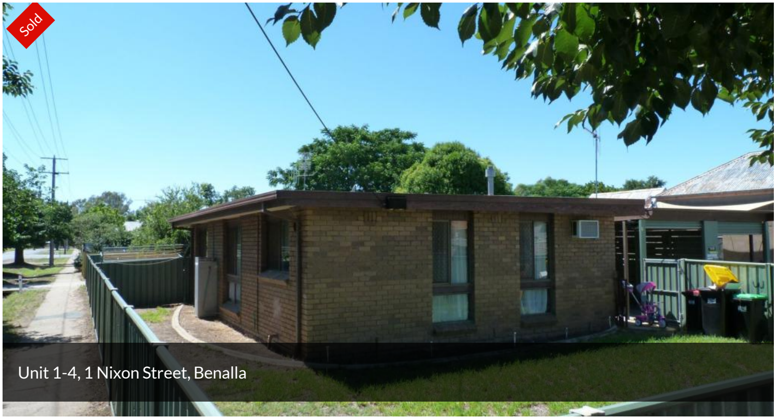
Unit 1-4, 1 Nixon Street, Benalla