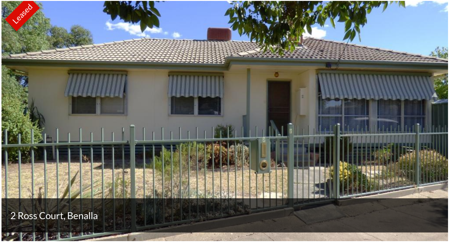
2 Ross Court, Benalla