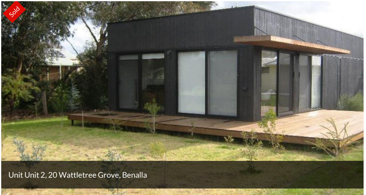
Unit Unit 2, 20 Wattletree Grove, Benalla