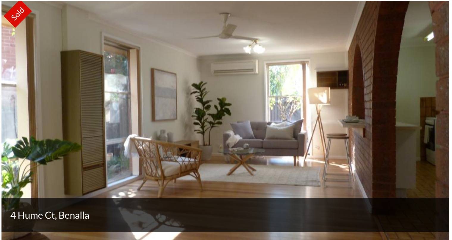
4 Hume Ct, Benalla