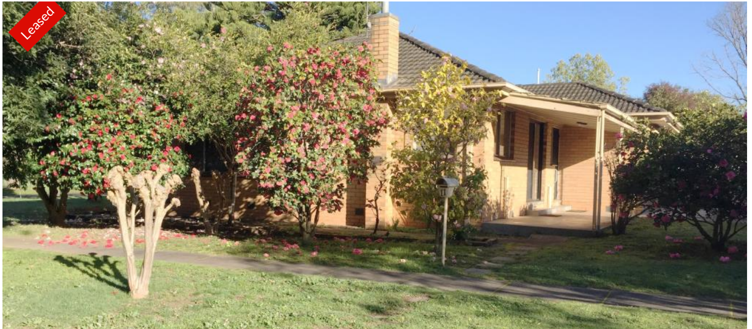
11 Hair Cres, Benalla